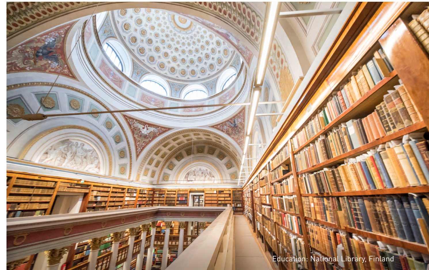
Education: National Library, Finland