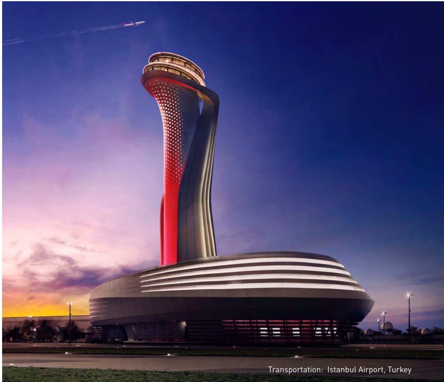
Transportation: Istanbul Airport, Turkey