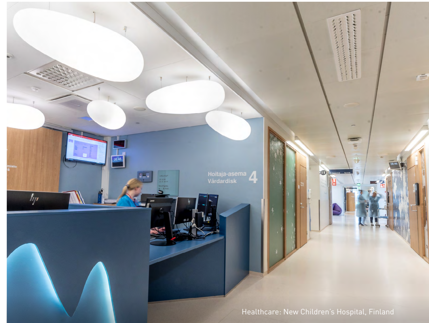
Healthcare: New Children's Hospital, Finland