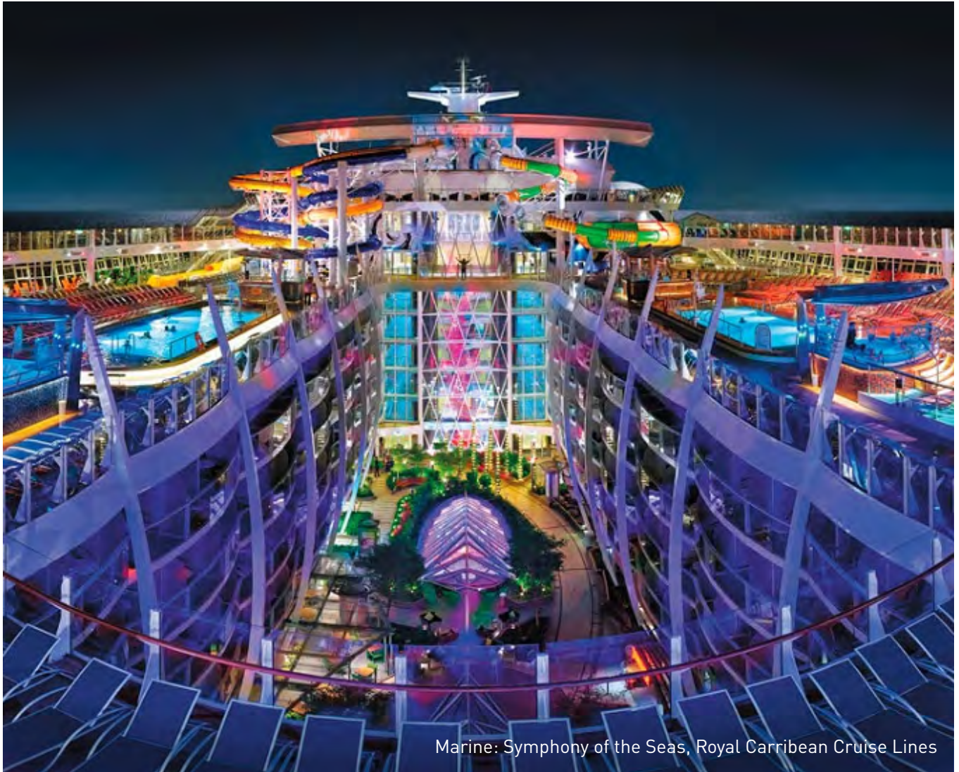
Marine: Symphony of the Seas, Royal Carribbean Cruise Lines

“ Harmony of the Seas is like a floating city, so we needed a lighting control solution that is simple to install and gives us all the capabilities we need on a project of this size and complexity.